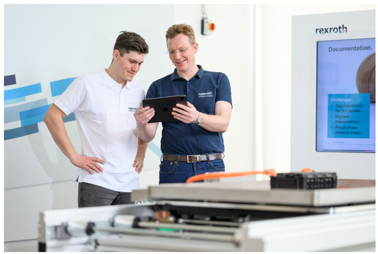
At HANNOVER MESSE 2023, Bosch Rexroth will present the first industrial automation solution for the success-critical step of deep discharging high-performance battery cells.

Sales of electric vehicles are increasing sharply throughout the world. The recycling of high-performance batteries to recover the valuable chemical components as part of a sustainable circular economy is thus a key issue. At HANNOVER MESSE 2023, Bosch Rexroth will present the first industrial automation solution for the success-critical step of deep discharging. Thanks to the new system, a process that used to take 24 hours now takes less than 15 minutes.