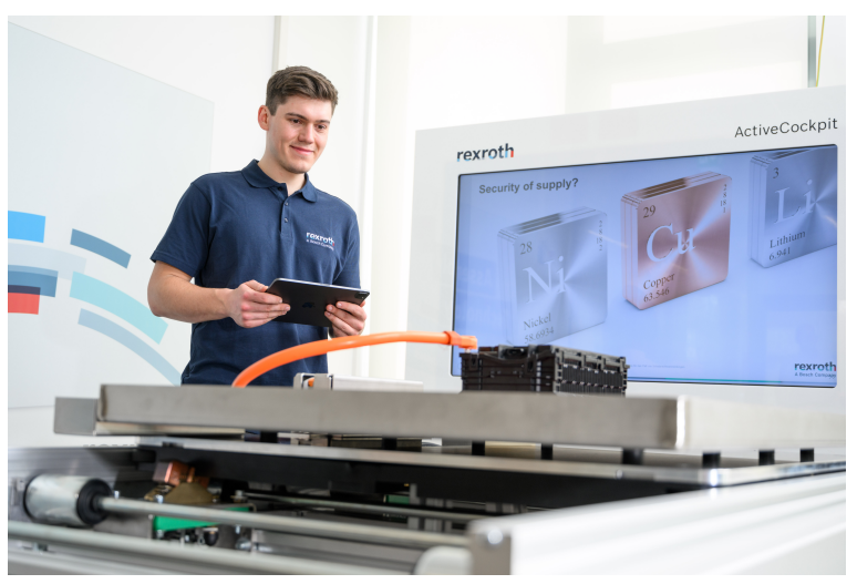
As part of a patented process, an automation solution from Bosch Rexroth takes over the innovative deep discharging of high-performance battery cells.