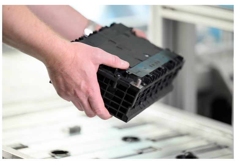
By recycling the batteries, up to 95 percent of the chemical elements can be fed back into the battery production process.