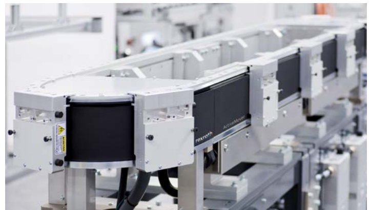
Bosch Rexroth's ActiveMover is a highly dynamic, flexible transfer system based on linear motors. ActiveMover unlocks the potential to increase productivity for small batch sizes, thanks to its quick and precise positioning of workpiece pallets.