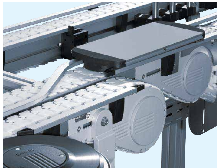
Standardized modular components such as diverters, accumulators, stop units and curve units make it easy to adjust and reconfigure transport layouts based on constantly changing consumer preferences and packaging formats.

Engineered to maximize modularity, Bosch Rexroth conveyors feature components that can be easily combined for custom layouts. These components can include the flexible chain, guide components, curves, motors and gearboxes. Variable configurations can accommodate different package sizes and shapes and different climbs and descent rates when moving product from one level to another on a line. Another important factor to consider is the quality of the plastic chain itself. A stable chain that can handle high tensile forces (VarioFlow plus supports up to 1250 N) at high speed can save system cost by reducing the number of drives needed over a given length.