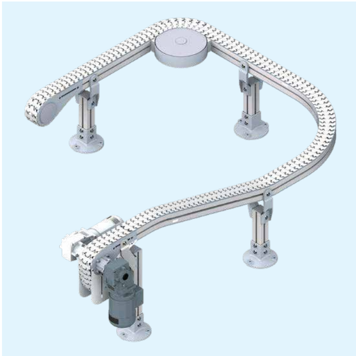
New materials and multiple plastic chain options like those offered by VarioFlow plus give packaging line operations options as they design solutions for their unique product and operational requirements.

As the industry continues to evolve, modern plastic chain conveyor systems are changing with it. Choosing the right system that delivers the flexibility you need is critical for long-term success when implementing a new packaging line or upgrading existing facilities. Understanding what the latest generation of plastic chain transport systems offers can help packaging lines make the best choice to improve productivity and minimize downtime.