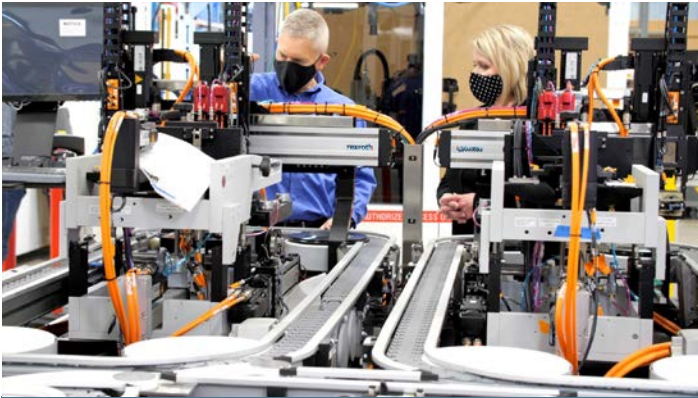
The Rexroth VarioFlow plus flexible chain conveyor system, configured with workpiece pallets, was ideal for the size of the product being manufactured, its weight and the throughput speeds and stopping accuracy required.

Because the assembly cells are so tightly packed with automation components, the VarioFlow plus system allowed for many processes to occur, while still maintaining the pallet position on the conveyor system through each of the tools. In addition, the VarioFlow plus made it easier to create a recirculating system to return the empty pallets back to the beginning and start the process over again, saving valuable floor space. Bosch Rexroth also worked closely with DWFritz to enable an open architecture for the manufacturing line.