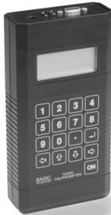
Model CS-CAL/DLIU V6.0