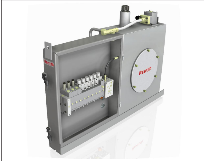
► Modular M4 valve enclosure with reservoir, for rear frame installation with side valve mount, model RFSVM