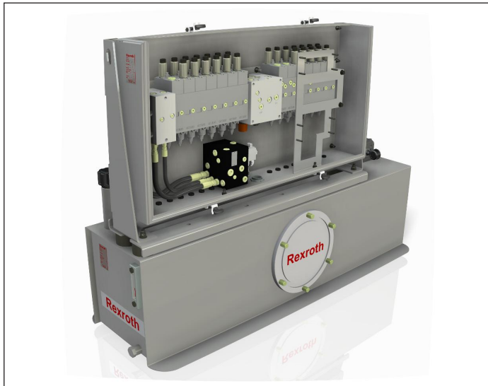
► Modular M4 valve enclosure with reservoir, for rear frame installation with top valve mount, model RFTVM