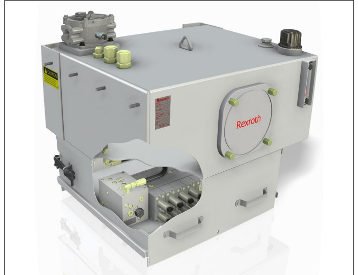
► Modular M4 valve enclosure with reservoir, for side frame installation with bottom valve mount, model SFBVM