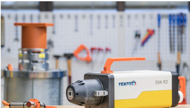
Compact, safe, efficient: The SVA R2 electric subsea valve actuator from Bosch Rexroth replaces the hydraulic cylinders that were previously required in the subsea process industry.