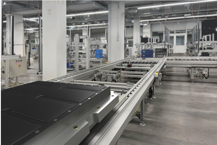
The new TS7 transfer system can safely and reliably transport battery packs weighing well more than a ton through assembly areas.