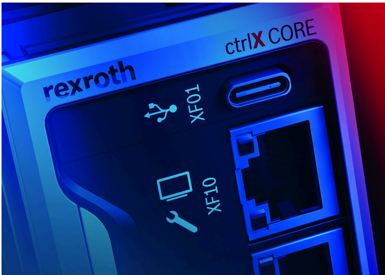
the control platform ctrlX CORE is used, for example, in the end-of-line testing of battery packs.