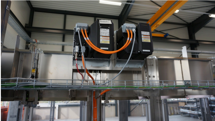
Control cabinet-free: The decentralized IndraDrive Mi drive solution allows a modular construction and reduces cabling thanks to serially laid hybrid cables.