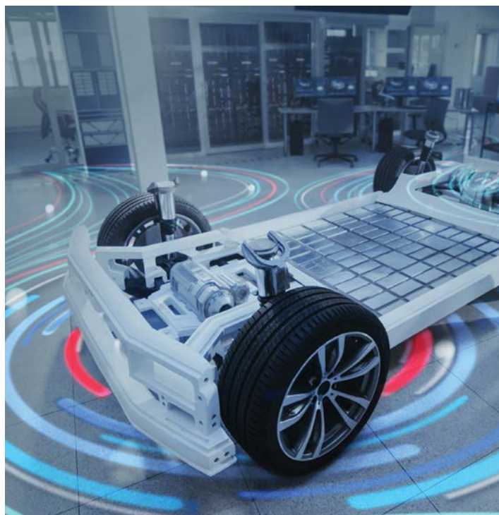
As electric vehicle manufacturers strive to expand production to meet surging demand, Bosch Rexroth has complete, open, innovative automation solutions to revolutionize EV manufacturing.

Bosch Rexroth has an industry-leading portfolio of automation technology to satisfy these needs, whether building new production lines or (as some manufacturers are doing) converting existing internal combustion (IC) assembly facilities to EV production. We have decades of experience providing manufacturing and automation solutions to leading automotive OEMs as well as Tier 1 and Tier 2 suppliers. In addition, as part of the Bosch Group of companies, one of the leading manufacturers and suppliers of components for passenger cars, commercial vehicles and more, our automotive “DNA” runs deep.