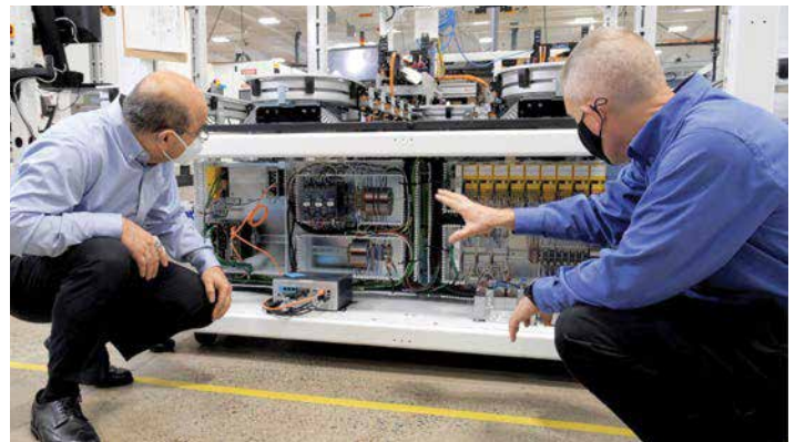
Using the Rexroth ctrlX AUTOMATION platform and its ctrlX CORE controller not only made this project successful, but it enabled the customer to build future production lines using the same software and hardware platform.

“One of our most important goals was to have an open machine control architecture so that our customer’s servers could directly query the machine and get real-time data,” said Dulani. “Using the Rexroth ctrlX AUTOMATION platform and its ctrlX CORE controller not only made this project successful, but it enabled our customer to build future production lines using the same software and hardware platform.” Rexroth’s ctrlX AUTOMATION platform