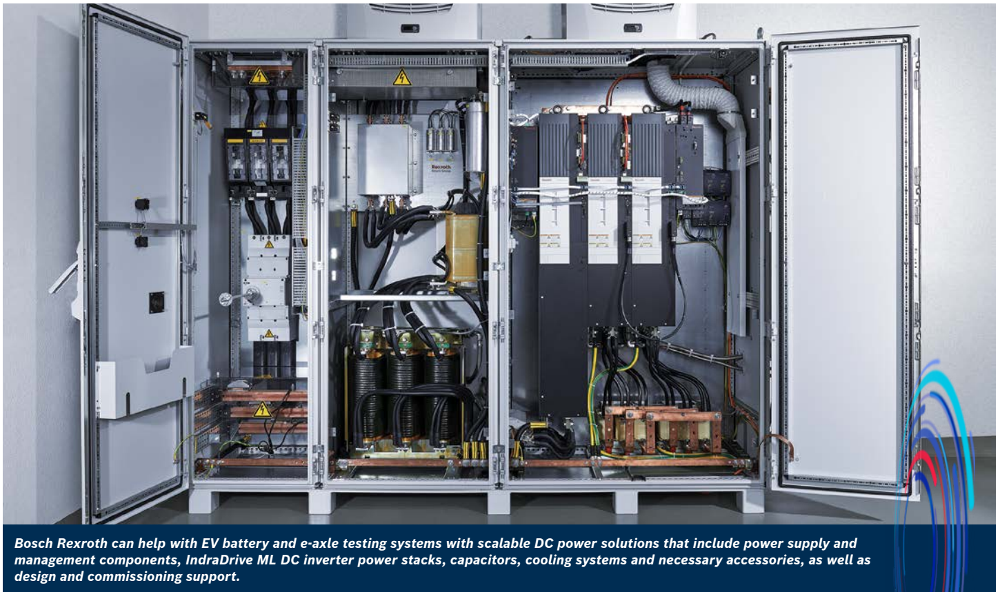
Bosch Rexroth can help with EV battery and e-axle testing systems with scalable DC power solutions that include power supply and management components, IndraDrive ML DC inverter power stacks, capacitors, cooling systems and necessary accessories, as well as design and commissioning support.

As a leading supplier of transport solutions, Bosch Rexroth's portfolio encompasses a full range of systems, including the proven TS family of chain conveyors and the ActiveMover linear motor transport system. Combined with our intralogistics AMRs, Bosch Rexroth is uniquely equipped to address virtually every battery production transport challenge.