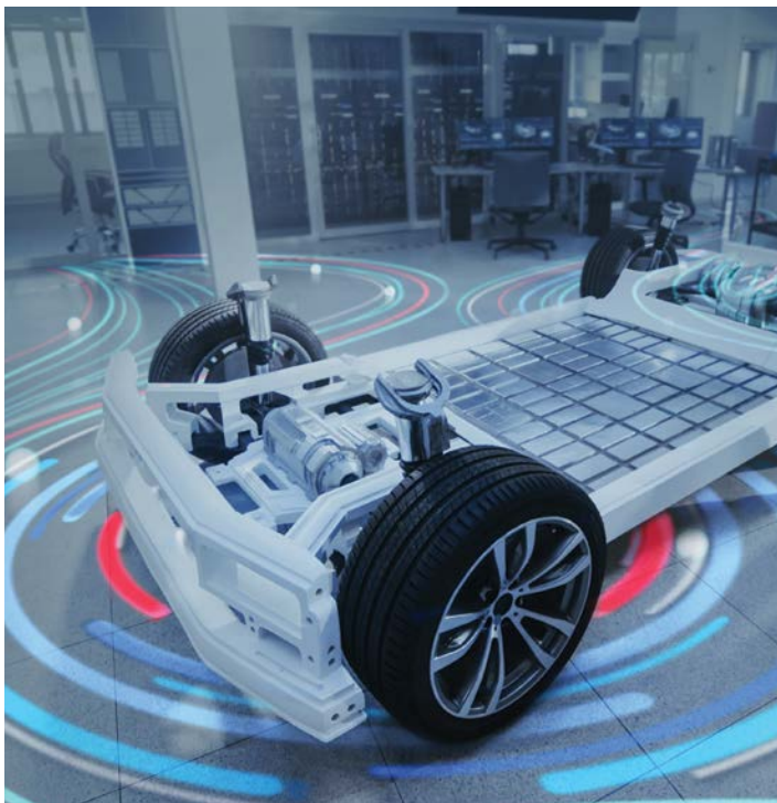
As electric vehicle manufacturers strive to expand production to meet surging demand, Bosch Rexroth has complete, open, innovative automation solutions to revolutionize EV manufacturing.

Bosch Rexroth has an industry-leading portfolio of automation technology to satisfy these needs, whether building new production lines or (as some manufacturers are doing) converting existing internal combustion (IC) assembly facilities to EV production. We have decades of experience providing manufacturing and automation solutions to leading automotive OEMs as well as Tier 1 and Tier 2 suppliers. In addition, as part of the Bosch Group of companies, one of the leading manufacturers and suppliers of components for passenger cars, commercial vehicles and more, our automotive “DNA” runs deep.