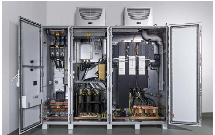
Bosch Rexroth’s IndraDrive ML scalable range of inverters enables effective solutions for battery pack and e-axle testing, with a scalable DC/DC drive design that provides the smallest footprint and weight to save valuable control cabinet space.

End-of-line battery and e-axle testing systems must take into consideration the challenges associated with high-output mass production of vehicles using them – by one estimate, a plant producing 50 EVs an hour would have a new battery pack to test every 72 seconds. Battery packs and e-axes are complex devices, with size and weight dimensions that require careful handling to move efficiently through testing systems.