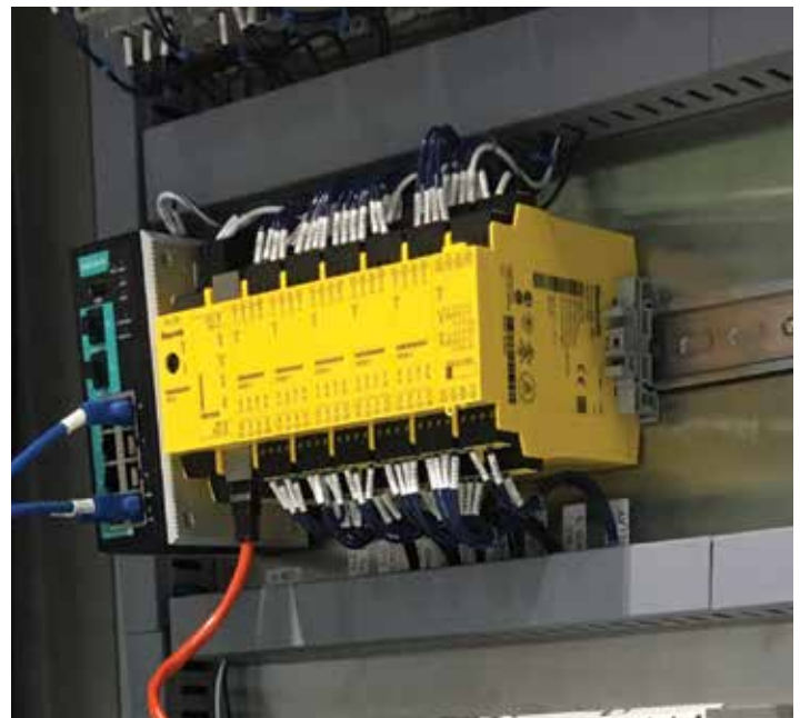
Rexroth SafeLogic Compact reduces downtime, scrap and waste