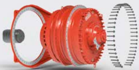
HÄGGLUNDS MB 2400