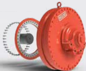
HÄGGLUNDS MA 800