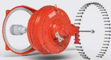
HÄGGLUNDS MB 1150/1600