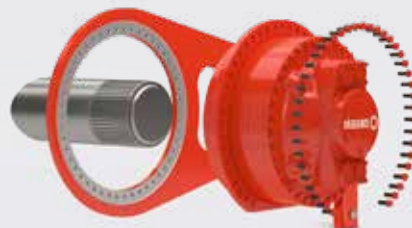
HÄGGLUNDS CB 840