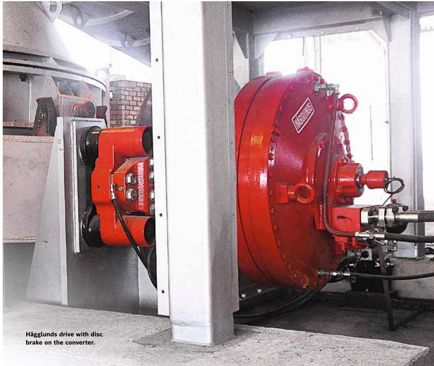
Häggglunds drive with disc brake on the converter.

Swedish innovator UHT (Uvån Hagfors Teknologi AB) is a global supplier of metallurgical processes for steel, ferroalloys and stainless steel manufacturing. Much of its business lies in converter refining, where the company's equipment and process control take advantage of Häggglunds direct drive systems from Bosch Rexroth.