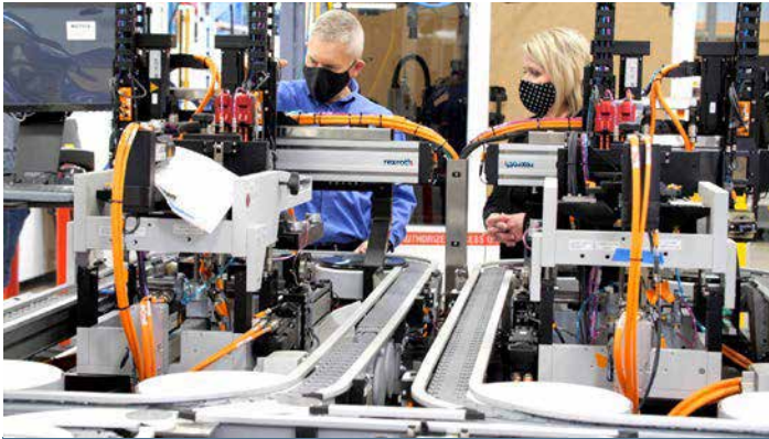
The Rexroth VarioFlow plus flexible chain conveyor system, configured with workpiece pallets, was ideal for the size of the product being manufactured, its weight and the throughput speeds and stopping accuracy required.

Because the assembly cells are so tightly packed with automation components, the VarioFlow plus system allowed for many processes to occur, while still maintaining the pallet position on the conveyor system through each of the tools. In addition, the VarioFlow plus made it easier to create a recirculating system to return the empty pallets back to the beginning and start the process over again, saving valuable floor space. Bosch Rexroth also worked closely with DWFritz to enable an open architecture for the manufacturing line.