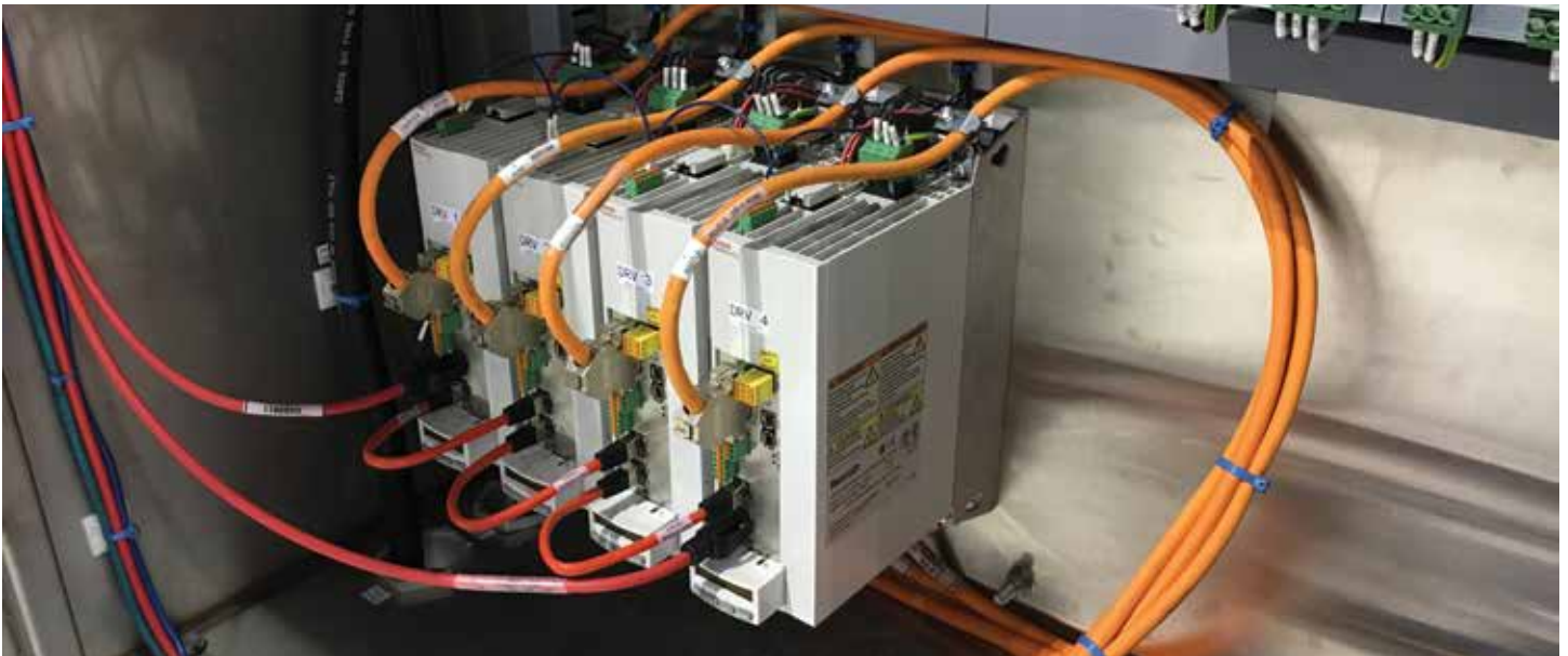
Rexroth offers IndraDrive Cs servo drives for higher throughput, safer and more cost-effective machine operations