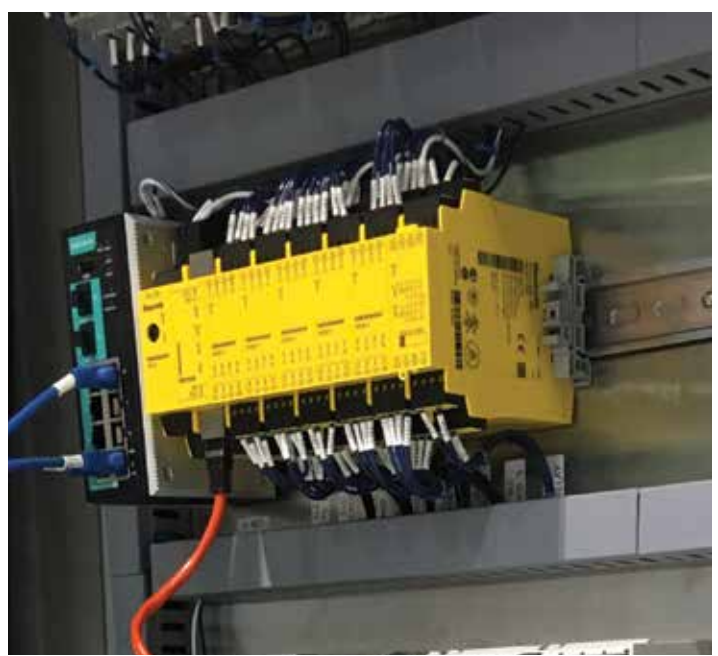
Rexroth SafeLogic Compact reduces downtime, scrap and waste