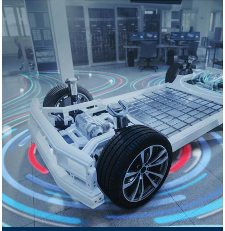
As electric vehicle manufacturers strive to expand production to meet surging demand, Bosch Rexroth has complete, open, innovative automation solutions to revolutionize EV manufacturing.

Bosch Rexroth has an industry-leading portfolio of automation technology to satisfy these needs, whether building new production lines or (as some manufacturers are doing) converting existing internal combustion (IC) assembly facilities to EV production. We have decades of experience providing manufacturing and automation solutions to leading automotive OEMs as well as Tier 1 and Tier 2 suppliers. In addition, as part of the Bosch Group of companies, one of the leading manufacturers and suppliers of components for passenger cars, commercial vehicles and more, our automotive "DNA" runs deep.