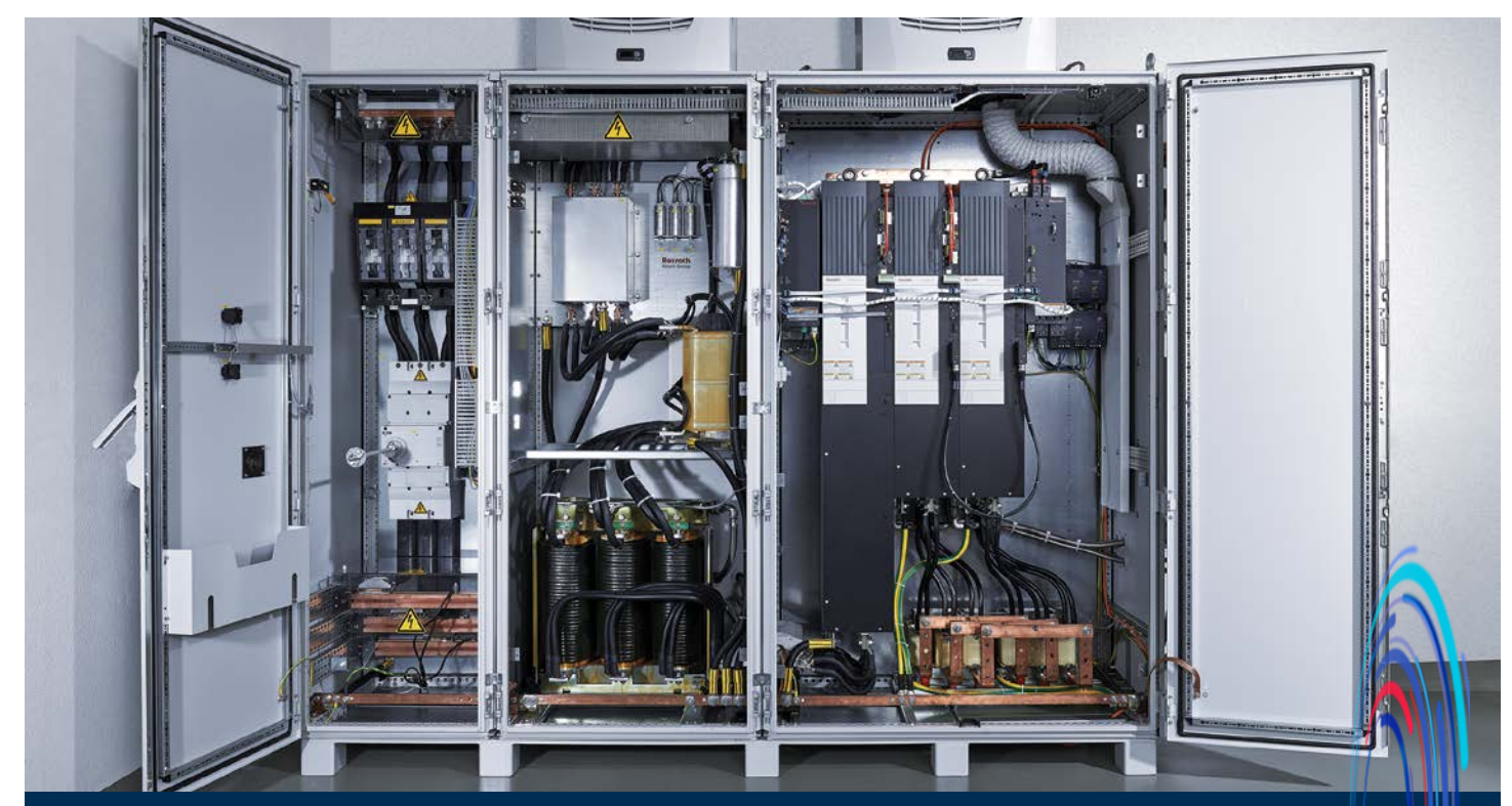
Bosch Rexroth can help with EV battery and e-axle testing systems with scalable DC power solutions that include power supply and management components, IndraDrive ML DC inverter power stacks, capacitors, cooling systems and necessary accessories, as well as design and commissioning support.

As a leading supplier of transport solutions, Bosch Rexroth's portfolio encompasses a full range of systems, including the proven TS family of chain conveyors and the ActiveMover linear motor transport system. Combined with our intralogistics AMRs, Bosch Rexroth is uniquely equipped to address virtually every battery production transport challenge.