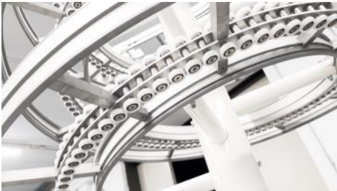
Image 3: The spiral transport system from smartPac Srl is based on components from the VarioFlow modular system and thus offers a consistent system solution for the space-saving and efficient transport of goods.