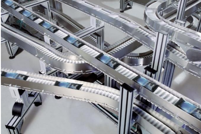
Image 2: Space-saving and cost-effective transport of consumer goods (Image source: Bosch Rexroth AG)