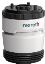
Image 5: The Smart Flex Effector makes intelligent robotics even more precise and increases performance in handling and joining processes.