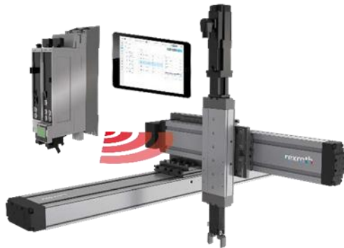
Image 4: With the Smart Function Kit, Bosch Rexroth provides a single- or multi-axis system solution for various holding tasks that can be operated intuitively via Web HMI.