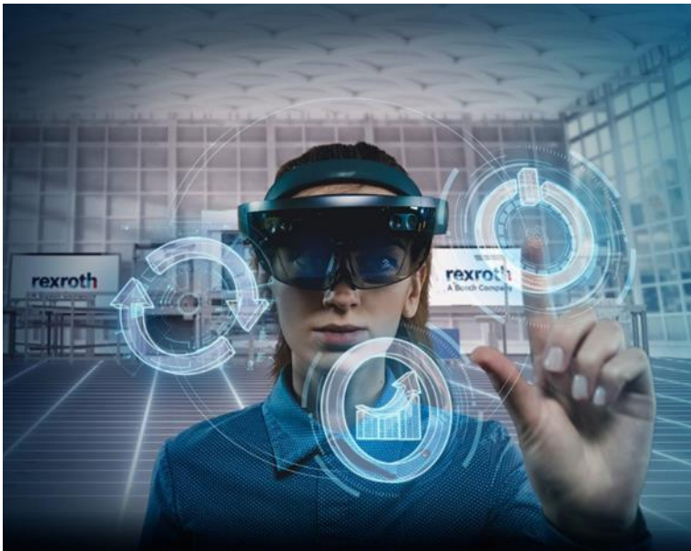
Image 1: With Smart MechatroniX, Bosch Rexroth offers new solutions for the Factory of the Future.

With the new Smart MechatroniX solution platform, which combines best-in-class linear motion technology components with electronics and software, Bosch Rexroth is responding to market trends in factory automation on the way to the Factory of the Future. The resulting solutions can be used in a wide range of areas. Not only do they allow quick commissioning — they also offer full process transparency and ensure a short time-to-market and high productivity.