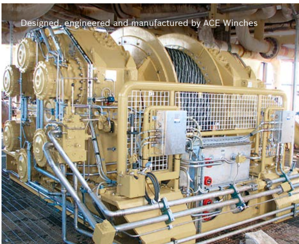
Designed, engineered and manufactured by ACE Winches