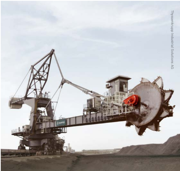
Thyssenkrupp Industrial Solutions AG