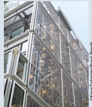
Cellophane House, KieranTimberlake

Rexroth framing served as the structural framework to which other building elements were swiftly attached. Just as the elements were assembled easily, so were they disassembled easily and stored for future redeployment, preserving the energy embodied in the house materials. In an effort to further reduce waste, the dimensions of the house were dictated by the standard measurements of the Rexroth extrusions.