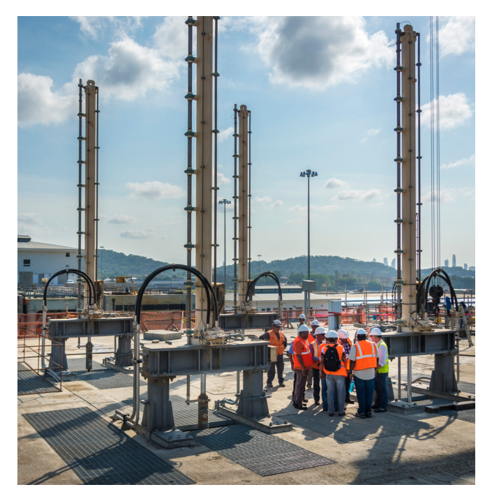
Every drive cylinder is equipped with a position measurement system which allows for the exact recording of the valve positions