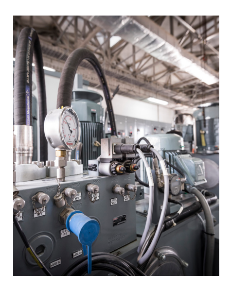
Control block of a hydraulic power unit with pressure gauge